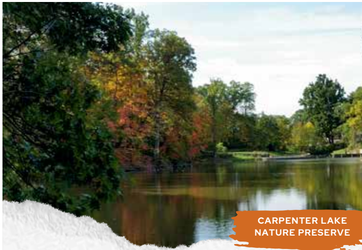
CARPENTER LAKE NATURE PRESERVE