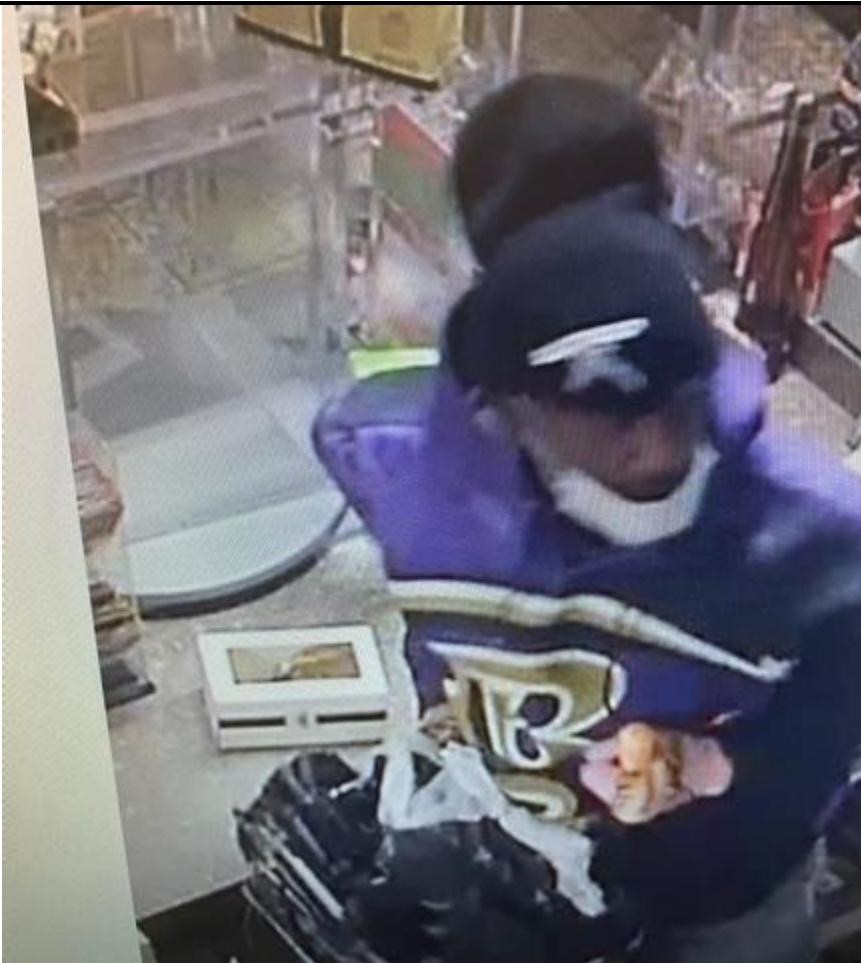
Suspect: Market B&E