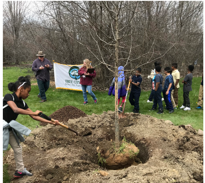
Birney K-8 School students participate in Arbor Day by studying the beneficial impact of trees to our environment and by planting a tree on school grounds.

Trees, deemed dead or dangerous, do not require a tree removal permit. Exceptions are made for fast growing “weed” trees, such as mulberry or Chinese elms.