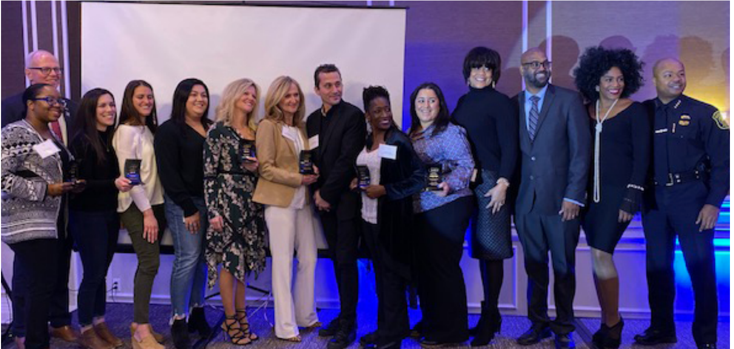
Honorees and hosts of the 2019 Excellence in Southfield Business Awards sponsored by the Southfield Chamber of Commerce.