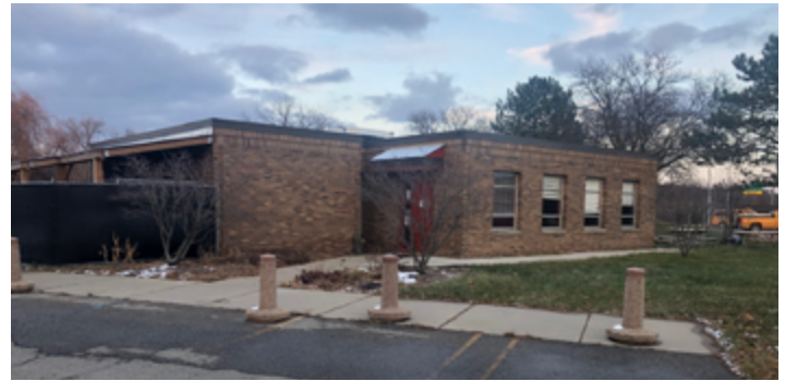
Renovated Southfield animal shelter on Clara Lane

Renovations included a complete overhaul of the kennel area as well as upgrades to the main office. Each kennel now includes privacy walls on each side along with doors leading to a covered and fenced outdoor area. With