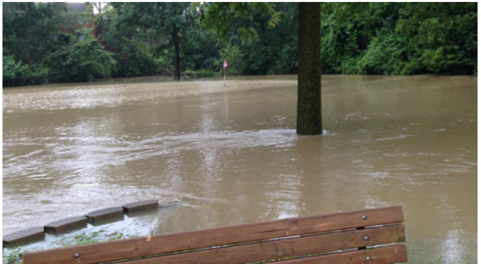
Flooded 4th hole at Beech Woods Golf Course

Today, there are 74 golf courses in Oakland County. Competition for golfers is stiff and at a time when fewer people are playing golf. Because of this competition and the expense, numerous municipal golf courses have closed over the years. Southfield's two golf courses are losing money and are subsidized to keep afloat.