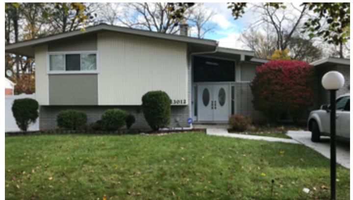
A typical home in Plumbrooke Estates

The designation of these two neighborhoods came about due to a rising interest in preserving Mid-Century Modern architecture. In 2016, Mayor Ken Siver successfully applied for a grant to draft comprehensive studies on